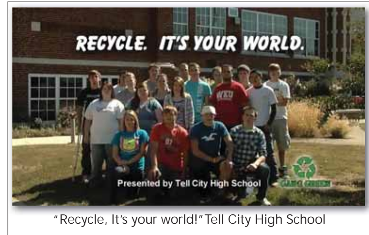
“Recycle, It’s your world!” Tell City High School

Check out the winning videos on the Indiana Recycling Coalition website!