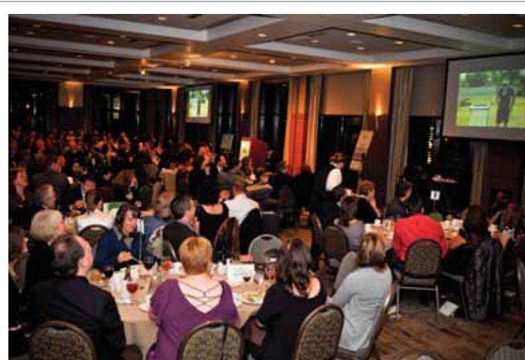
Guests watch the highlights of the IRC's 2010 America Recycles Day Video Contest