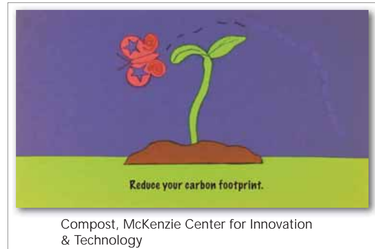
Compost, McKenzie Center for Innovation & Technology