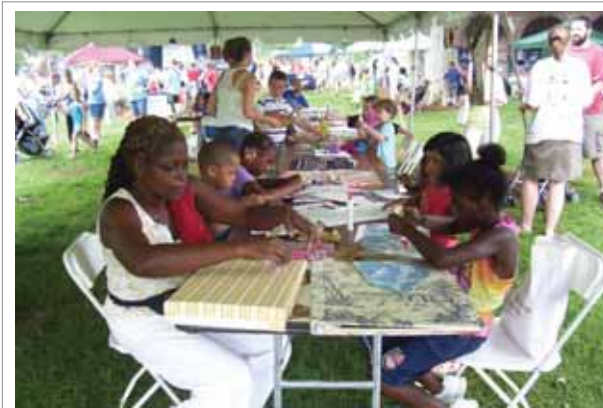
Families create recycled art at PBS Kids in the Park