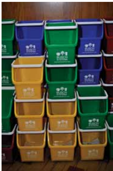
Recycling bin party favors provided by Busch Systems