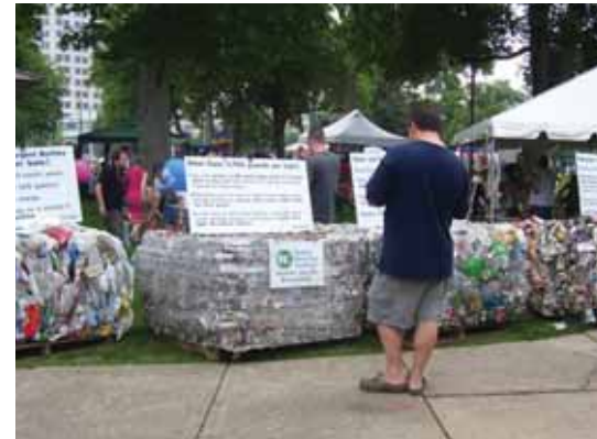
Visitors inspect baled recyclables at PBS Kids in the Park

The IRC also had the opportunity to participate in the “Green Broad Ripple” press conference announcing an expansion of bar and restaurant glass recycling. New behind-the-bar bins were donated by Saint-Gobain Containers and glass collection is being provided free of charge by Strategic Materials. The glass will be made into new bottles by Saint-Gobain at their central Indiana facility.